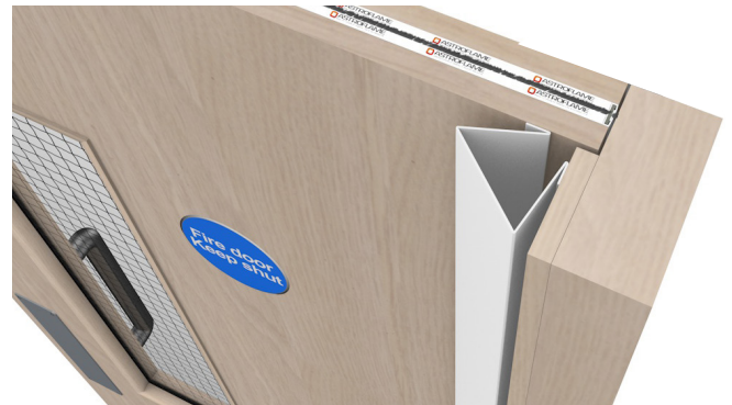
Astro FingerKeeper Commercial Front standard shown on a closed door