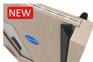
ANTHRACITE GREY (7016)