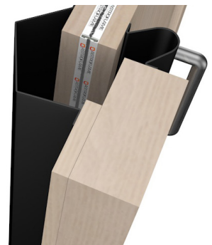
Astro FingerKeeper Commercial Front standard shown on an opened door