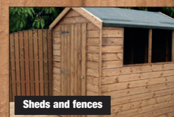
Sheds and fences